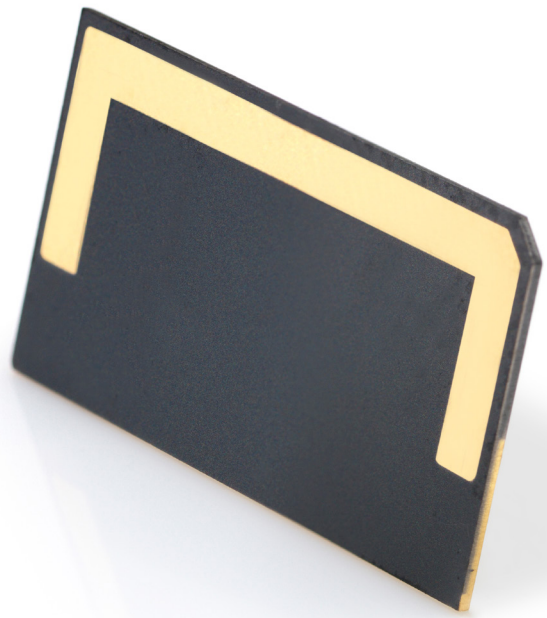
Element Six's Diafilm™ TM220

Another area in which these advances are showing great potential is the use of electronics in Nano Satellites, or CubeSats, that are currently being explored for Low Earth Orbit communication networks. Element Six's Diafilm™ TM220 offers an advantage of lower weight and improved life for these small but sophisticated devices, thanks to diamond's reliability, efficiency and high resistance to radiation.