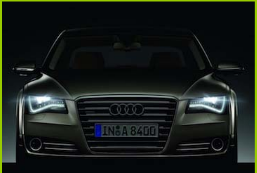
OSRAM Opto Semiconductors' OSTAR Headlamp LED has received a prestigious 2011 PACE Award for innovations in controlling forward headlamp functions, such as in the Audi A8 sedan.